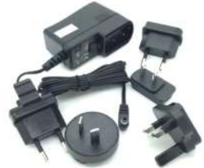
*Product images are for illustrative purposes only and may vary from actual design.