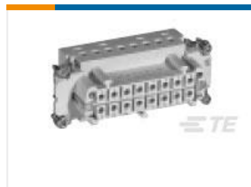
TE Part #1-1103639-1 HE.16.BU.S.B 1-16