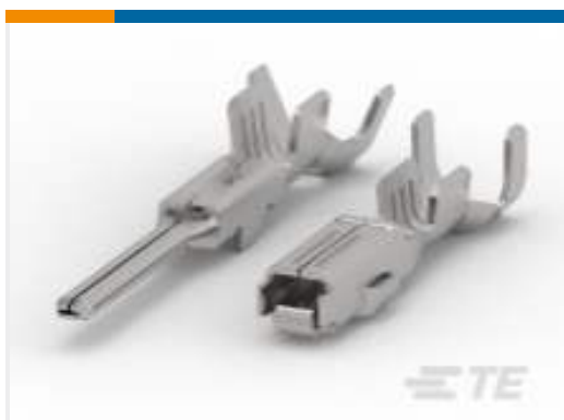
TE Part #638652-1 1.5/2.8 CONNECTOR SYSTEM, RECPT AND TAB