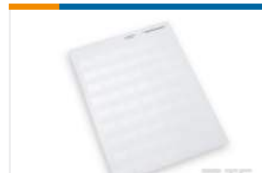
TE Part #9-1768016-7 CSL Self Laminating Polyester Labels