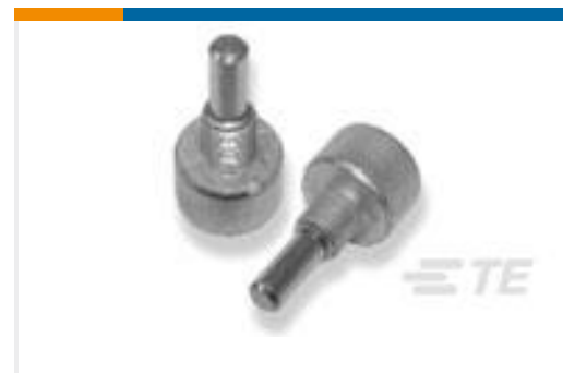
TE Part #2-1625931-9 MCU 2K2 10% 1"PL