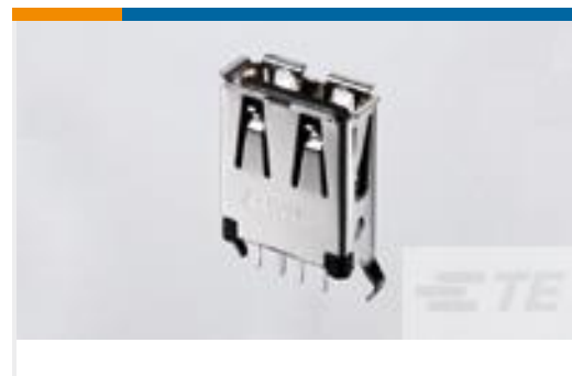
TE Part #1734366-3 Std USB Type A, VT, T/H, Blue