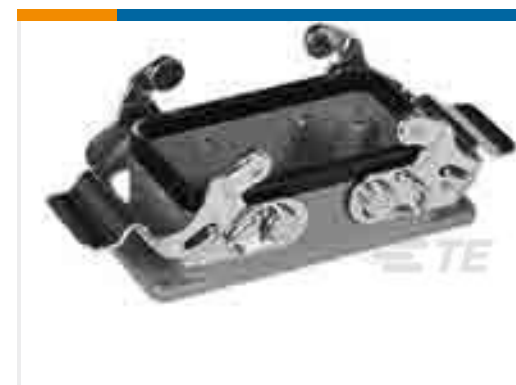
TE Part #1-1102296-1 HB.16.AG-VS