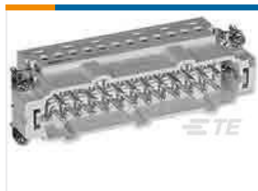
TE Part #1-1103640-8 HE24STI S-T.B12+6+6