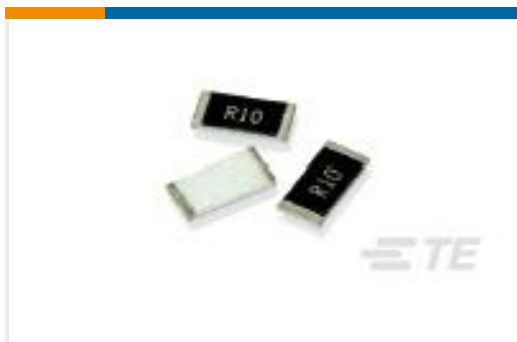
TE Part #4-2176058-2 RLP73K 3A R51 5% 2K RL