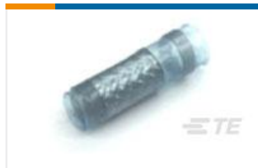
TE Part #514715-000 B-070-12-08-01