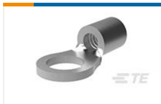
TE Part #8-35476-2 TERMINAL,SOLIS R 12-10 6