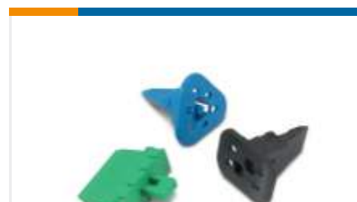
TE Part #W3S-P012 Wedgelocks: DEUTSCH DT