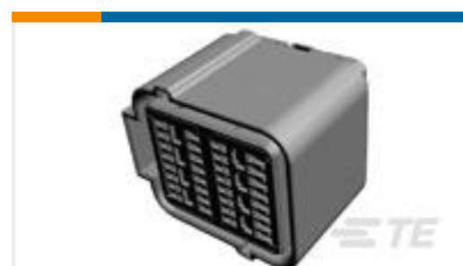
TE Part #1326018-2 .64MM,32P UNSEALED PLUG ASSY,B