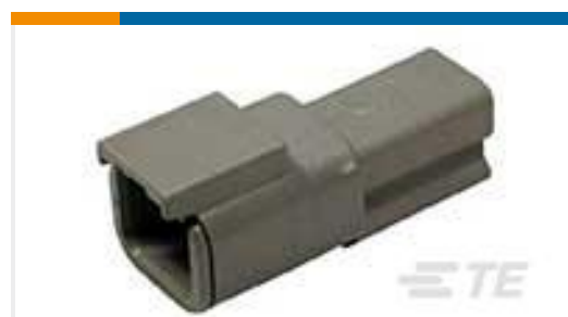
TE Part #DTM04-2P REC, 2P, GRY, N