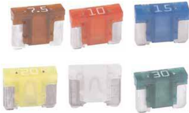
Dimensions - mm (in)