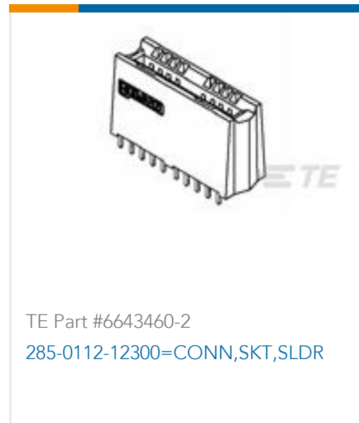
TE Part #6643460-2 285-0112-12300=CONN, SKT, SLDR