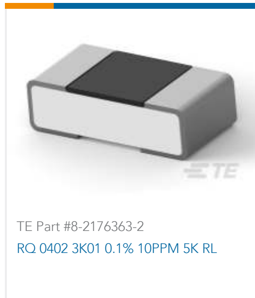
TE Part #8-2176363-2 RQ 0402 3K01 0.1% 10PPM 5K RL