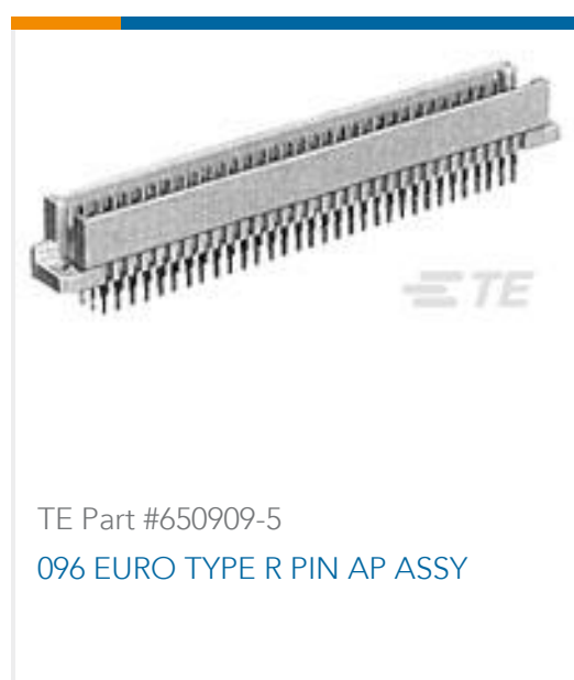
TE Part #650909-5 096 EURO TYPE R PIN AP ASSY