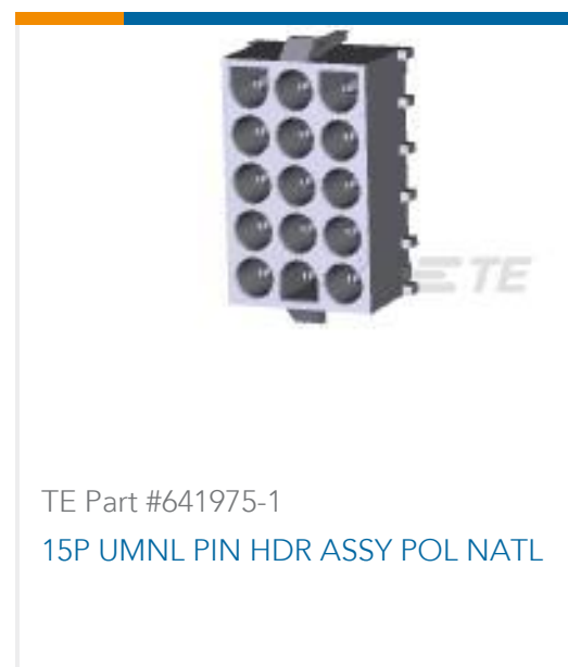
TE Part #641975-1 15P UMNL PIN HDR ASSY POL NATL