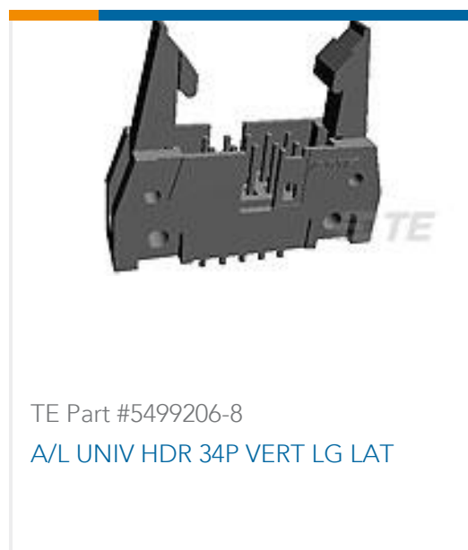
TE Part #5499206-8 A/L UNIV HDR 34P VERT LG LAT