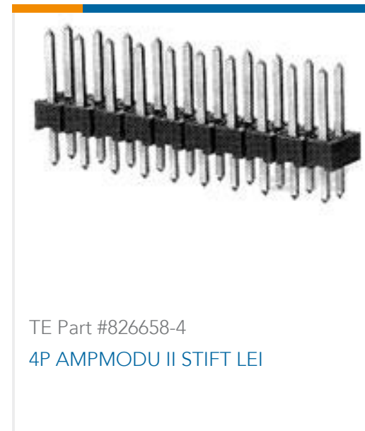
TE Part #826658-4 4P AMPMODU II STIFT LEI