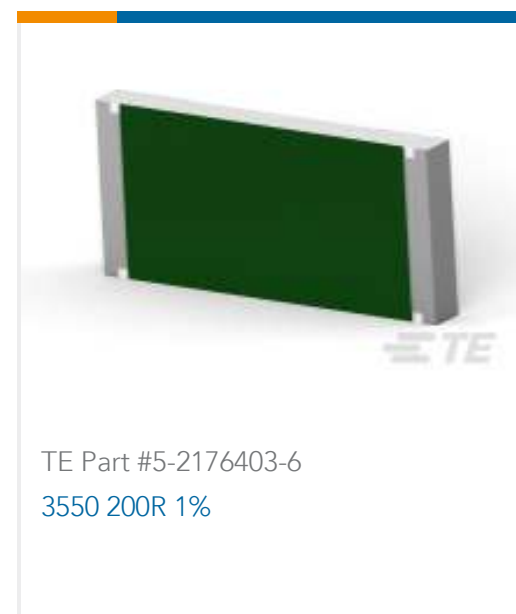
TE Part #5-2176403-6 3550 200R 1%