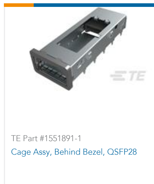
TE Part #1551891-1 Cage Assy, Behind Bezel, QSFP28