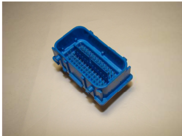
Small footprint header assembly