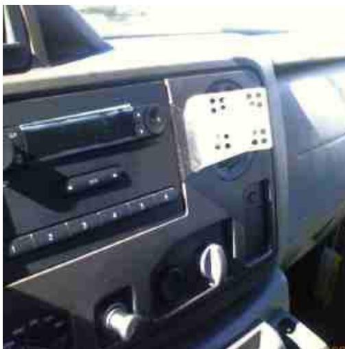
Finished Install Picture