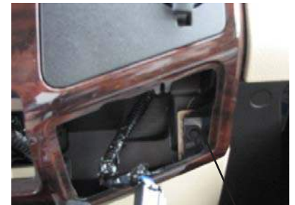
Right & Left Covers and Screws

INSTALLATION IS NOW COMPLETE. ENJOY YOUR NEW INDASH by PANAVISE MOUNT.