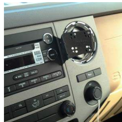
Final Installation Picture of Super Duty 2013 Without NAV

STEP #4: Replace the bezel in reverse order, Be sure to guide trailer brake back into slot.