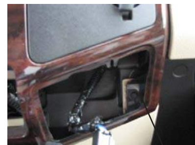
Right & Left Covers and Screws

INSTALLATION IS NOW COMPLETE. ENJOY YOUR NEW INDASH by PANAVISE MOUNT.