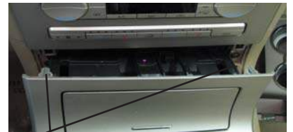
(2)Clips to Remove Ash Tray