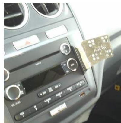
Final Installation Picture of Transit Connect 2013

INSTALLATION IS NOW COMPLETE. ENJOY YOUR NEW INDASH by PANAVISE MOUNT.