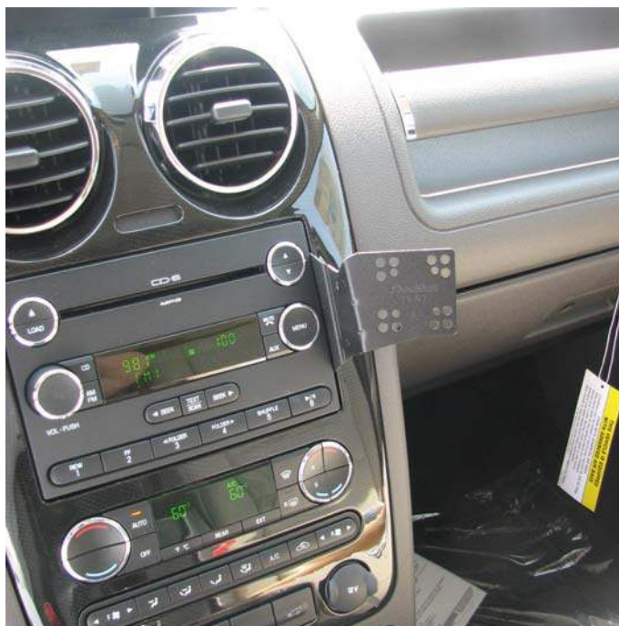
Final Installation Picture Ford TaurusX 08