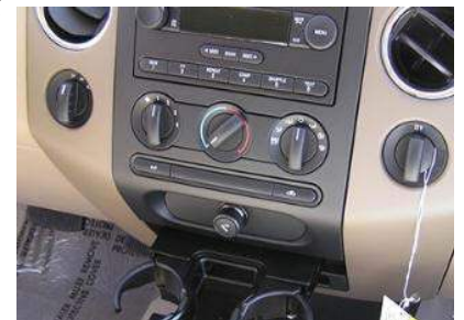
F-150 Without Console

STEP#3: With 9/32" socket driver remove the (2) screws that hold the right side of the radio in place. Place the InDash by PanaVise Mount Bottom Piece over the (2) screw holes. Reinstall the (2) screws. Install the top piece with the 75001 number on top with the (2) Acorn nuts using a 5/16" wrench.