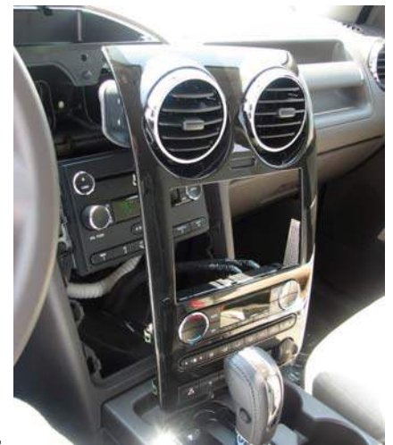
Dash Bezel Removed

INSTALLATION IS NOW COMPLETE. ENJOY YOUR NEW INDASH by PANAVISE MOUNT.