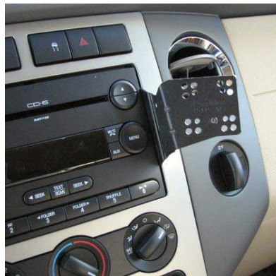
Expedition and F-150 Final Installation Picture