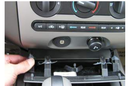
Expedition Cover Removal

STEP#1: For F-150 & Mark LT, Open the cup holder or tray below the lighter / power outlet. For Expedition , Insert hook tool into the side of the cover below the climate control to release (4) clips. Set this cover aside.