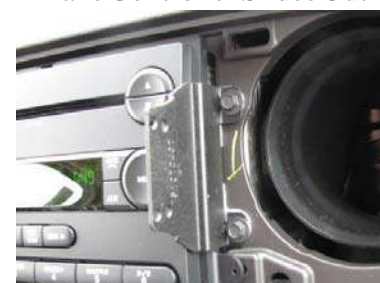
Bottom part in place