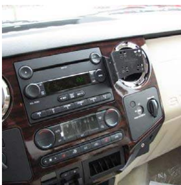
Final Installation Picture on 08-10