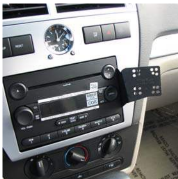
Final Installation Picture on 500 and Montego