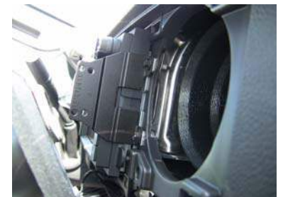
Bottom part in place