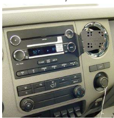
Final Installation Picture on 2011