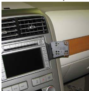
MKX Final Installation Picture