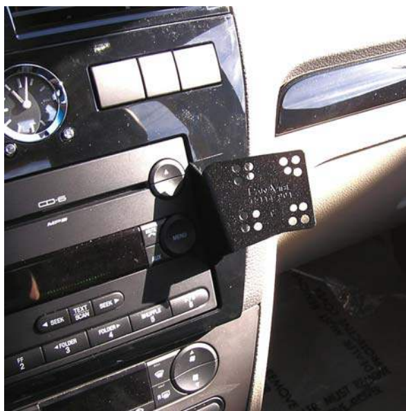
InDash installed showing location on Right Side

INSTALLATION IS NOW COMPLETE. ENJOY YOUR NEW INDASH by PANAVISE MOUNT.