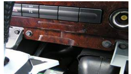
(2) screws below bezel

INSTALLATION IS NOW COMPLETE. ENJOY YOUR NEW INDASH by PANAVISE MOUNT.