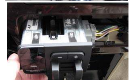
Brake Controller Slides Out