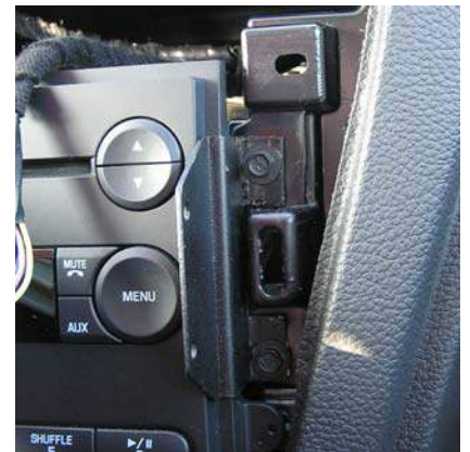
Bottom Part in Place, Right Side

STEP #3: Replace the bezel starting at the top. Install the Top part of the mount with the (2) Acorn Nuts and 5/16" wrench.