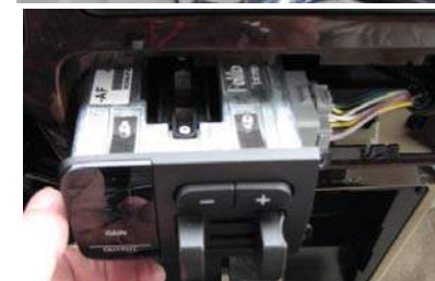
Brake Controller Slides Out