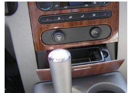
F-150 With Ashtray

STEP#2: With hook tool insert it between the bezel and dash below the lighter / power outlet, to the right or left side of the center bezel to release one clip on each side. Lift bezel out from the bottom to allow hook tool to fit in behind the bezel about the center of the sides of the radio. Pull to release (2) clips, (1) on each side. Insert hook tool into the upper part of the bezel between the bezel and upper tray. Pull on right or left side to release (2) clips, (1) on each side. Pull bezel out far enough and to the side to get at the screws that holds the right side of the radio in place. Use Clean Shop Cloth to protect surfaces as necessary.