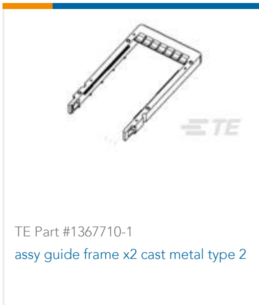
TE Part #1367710-1 assy guide frame x2 cast metal type 2