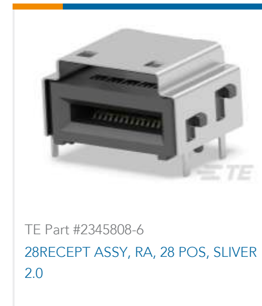
TE Part #2345808-6 28RECEPT ASSY, RA, 28 POS, SLIVER 2.0