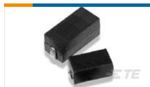
TE Part #6-1879233-1 SMW5 33R 5%