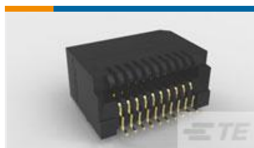
TE Part #1367073-1 20 POS SMT CONN, SFP, 15AU