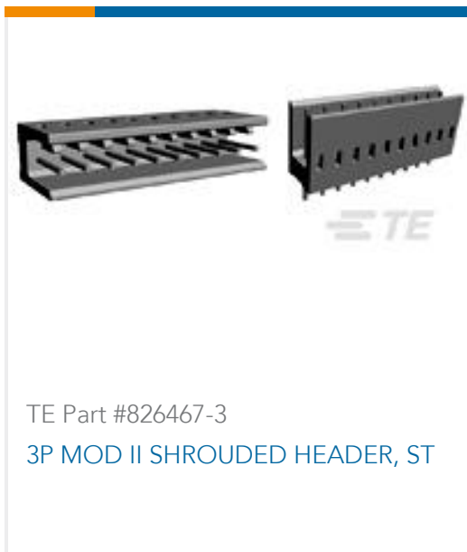
TE Part #826467-3 3P MOD II SHROUDED HEADER, ST