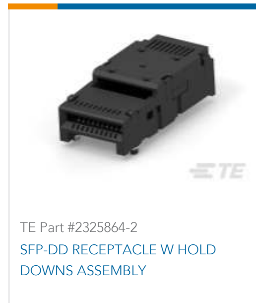
TE Part #2325864-2 SFP-DD RECEPTACLE W HOLD DOWNS ASSEMBLY