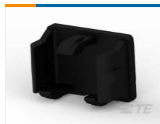
TE Part # 1367147-1 SFP COVER, UNPLATED