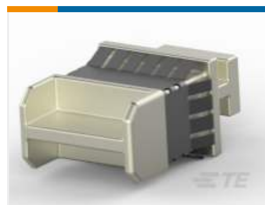
TE Part # 1888901-1 SFP+ EMI Plug