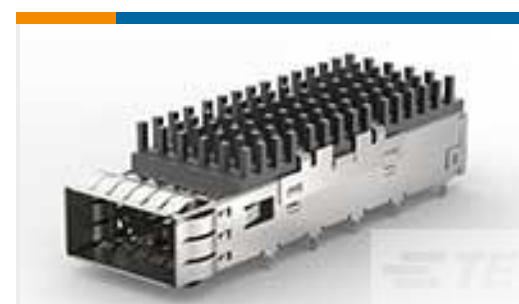
TE Part #2170704-2 CAGE ASSY, QSFP28 1X1, SPRING, HS