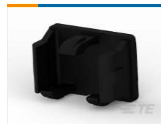
TE Part # 1367147-3 SFP COVER, UNPL, NO LOGO