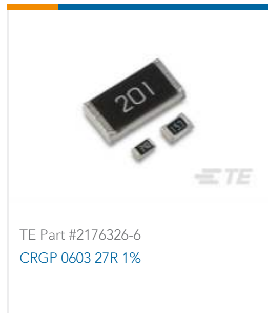
TE Part #2176326-6 CRGP 0603 27R 1%