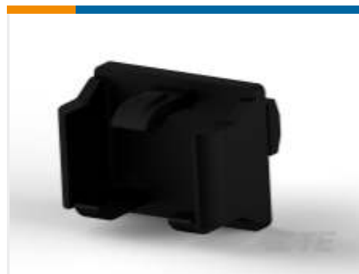
TE Part # 1761394-1 DUST COVER, SFP, GANGED & STACKED