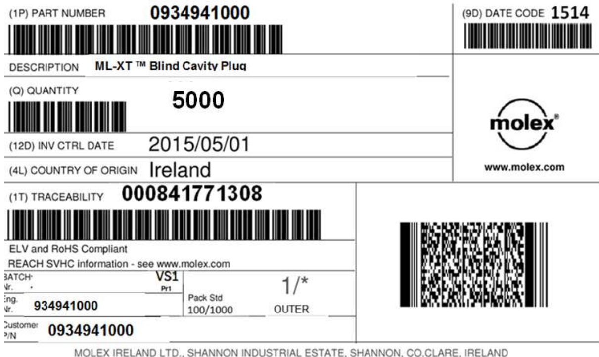
Figure 5: Molex Label Sample

The Molex labels to be used are the standard Molex Ireland labels (127.0 x 76.2mm).