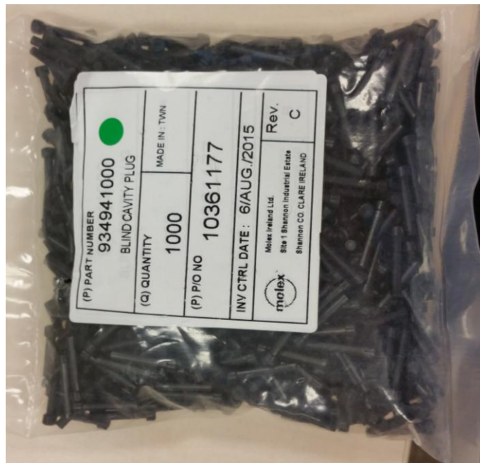
Figure 2: Vendor Label on Bag

The recommended quantities of parts are placed in the bag. The bag is then heat sealed and a standard Molex label is placed on the outside of the bag. The label must adequately describe the product details and factory order information.