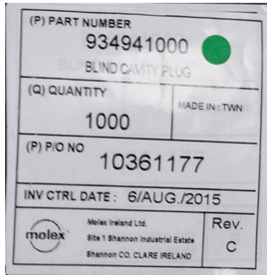
Figure 4: Vendor Label Sample (69.0 x 69.0mm)