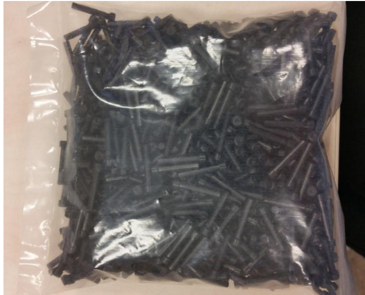
Figure 1: Parts Placed in Bag