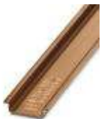
DIN rail, material: Copper, unperforated, height 7.5 mm, width 35 mm, length: 2 m

DIN rail - NS 35/ 7,5 CU UNPERF 2000MM - 0801762