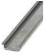
DIN rail, unperforated, Width: 35 mm, Height: 7.5 mm, Length: 2000 mm, Color: silver

DIN rail, unperforated - NS 35/ 7,5 AL UNPERF 2000MM - 0801704