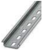
DIN rail, material: Galvanized, perforated, height 7.5 mm, width 35 mm, length: 2 m

DIN rail - NS 35/ 7,5 ZN PERF 2000MM - 1206421