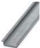
DIN rail, material: Galvanized, unperforated, height 7.5 mm, width 35 mm, length: 2 m

DIN rail - NS 35/ 7,5 ZN UNPERF 2000MM - 1206434