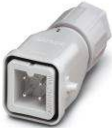
HEAVYCON QUICKON sleeve housing A3, for single locking latch, 3-pos., with PE connection, plug, QUICKON connection, straight cable outlet

Please be informed that the data shown in this PDF Document is generated from our Online Catalog. Please find the complete data in the user's documentation. Our General Terms of Use for Downloads are valid ( http://phoenixcontact.com/download )