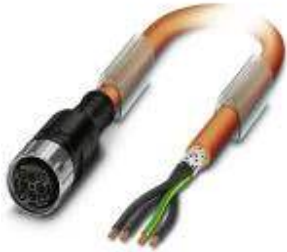
Cable plug in molded plastic, Length: 5 m, Color of outer sheath: orange RAL 2003

Please be informed that the data shown in this PDF Document is generated from our Online Catalog. Please find the complete data in the user's documentation. Our General Terms of Use for Downloads are valid ( http://phoenixcontact.com/download )