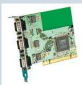
UC-431: uPCI 3xRS232