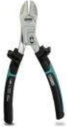
Power diagonal cutter, 200 mm, induction-hardened cutting, VDE 1000 V AC/ 1500 V DC tested

Please be informed that the data shown in this PDF Document is generated from our Online Catalog. Please find the complete data in the user's documentation. Our General Terms of Use for Downloads are valid ( http://phoenixcontact.com/download )