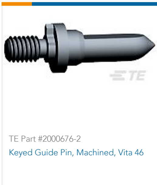
TE Part #2000676-2 Keyed Guide Pin, Machined, Vita 46