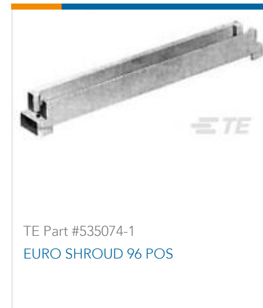
TE Part #535074-1 EURO SHROUD 96 POS