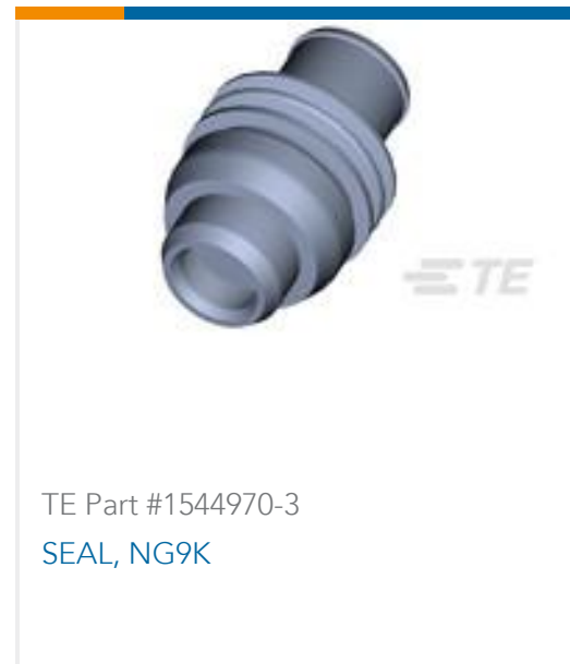
TE Part #1544970-3 SEAL, NG9K