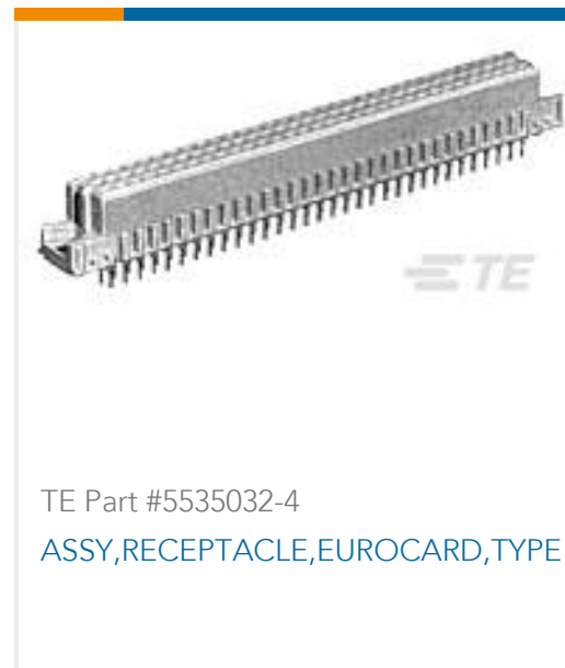
TE Part #5535032-4 ASSY,RECEPTACLE,EUROCARD,TYPE DEG