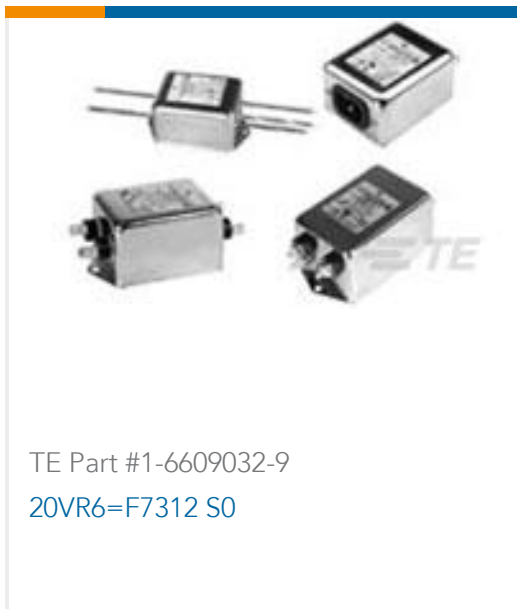
TE Part #1-6609032-9 20VR6=F7312 S0