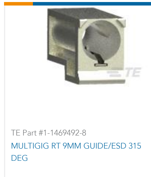
TE Part #1-1469492-8 MULTIGIG RT 9MM GUIDE/ESD 315 DEG