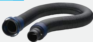
▶ BT-30 Length Adjusting