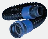
▶ BT-20S/37309 S/M (Approx. 28")