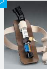
V-200 Vortemp™ Heating Assembly