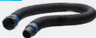
▶ BT-40 Heavy Duty