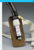
V-100/37018 Vortex Cooling Assembly