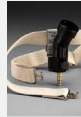
V-300/37019 Valve Assembly