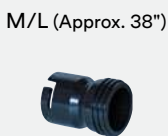
▶ BT-20L/37310 M/L (Approx. 38")