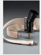
V-400/37020 Low-Pressure Assembly