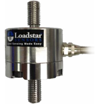
(With tension adapter TX-RSB3)