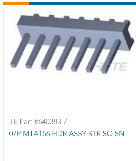
TE Part #640383-7 07P MTA156 HDR ASSY STR SQ SN