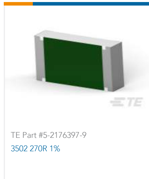
TE Part #5-2176397-9 3502 270R 1%