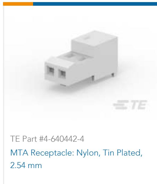
TE Part #4-640442-4 MTA Receptacle: Nylon, Tin Plated, 2.54 mm