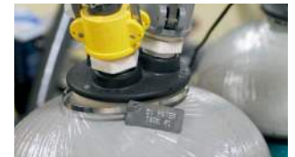
General Mechanical Identification