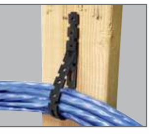
Stretch Cable Tie Roll