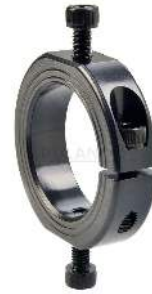
*Additional hardware #01 included