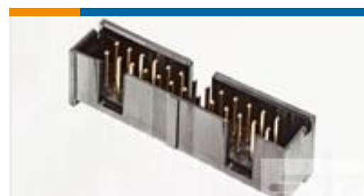
TE Part #5103308-6 A/L LOW PRO HDR 26P VERT BLACK