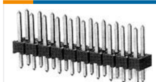
TE Part #2-826925-0 MOD 2 PIN HDR. 1X20P