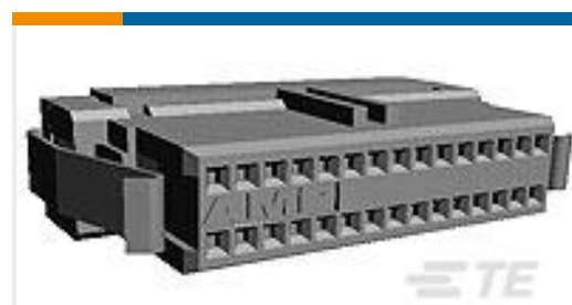
TE Part #3-111196-3 80 RCPT SYSTEM 50 30 DPLX