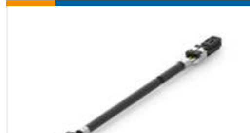
TE Part #2362764-4 MATENET, CABLE ASSY, 1 GBPS UTP