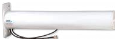
YE240015 Enclosed Yagi