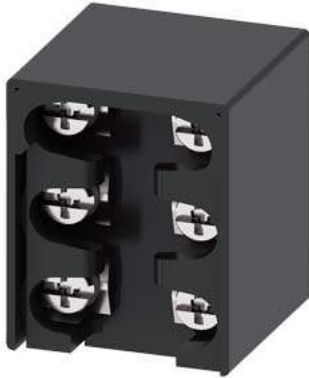
Contact block for position switch 3SE51/52 1 NO/2 NC quick action contact