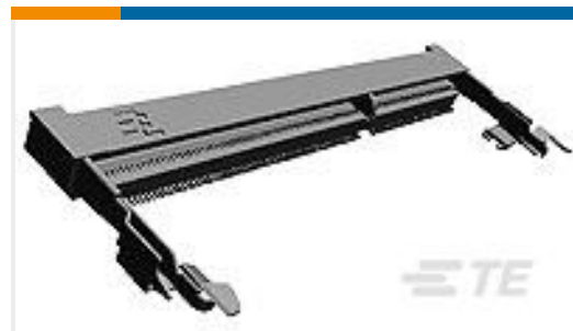
TE Part #2-2013289-1 EMBOSS TAPE DDR3 204P 5.2H STD