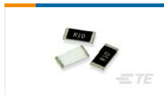
TE Part #2-2176051-6 RLP73K 1J R56 1% 1K RL