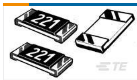
TE Part #2-1622820-5 3520 220R 5%