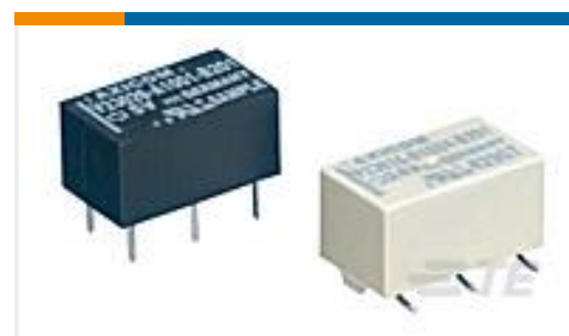
TE Part #3-1393774-4 V23026B1101B201