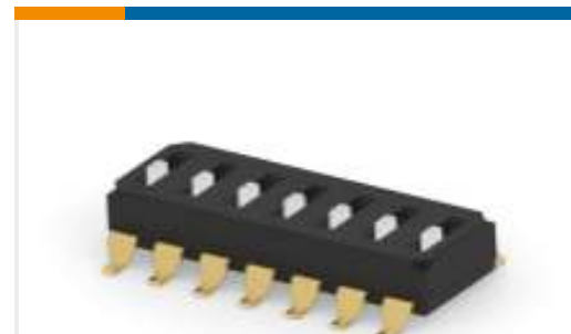
TE Part #2-2319847-8 END STACK DIP 7P G RAISED T&R