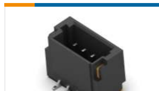
TE Part #2367197-4 1.0mm WTB Side Vertical Type With Latch