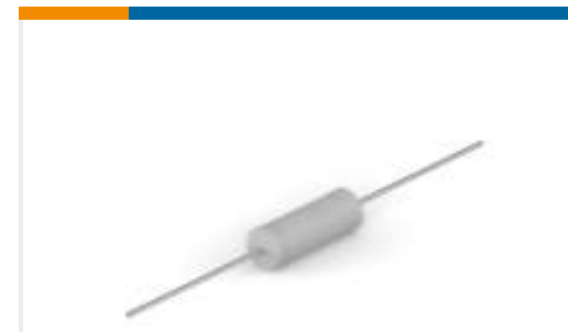
TE Part #2176412-5 5W XSM M/OX 5% 7R5