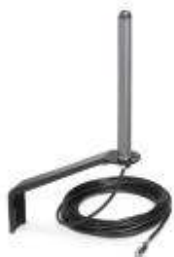
GSM-UMTS omnidirectional antenna, 2 dBi gain, 5 m antenna cable with SMA circular connector

Please be informed that the data shown in this PDF Document is generated from our Online Catalog. Please find the complete data in the user's documentation. Our General Terms of Use for Downloads are valid ( http://phoenixcontact.com/download )