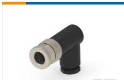
TE Part #T4012008041-000 M8,SCREW, FEMALE,R/A,UNSHIELDED, 4P,GOLD