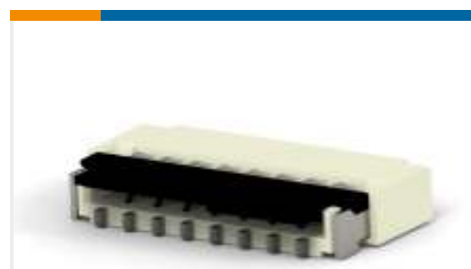
TE Part #3-2328724-1 31PIN 0.3MMP FPC CONNECTOR, FRONT FLIP