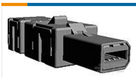
TE Part #2013595-1 INDUSTRIAL MINI I/O PLUG KIT D1