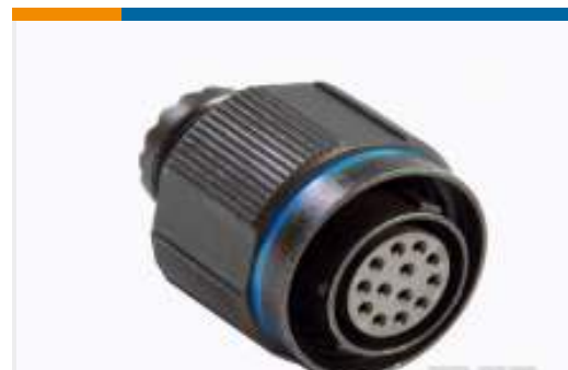
TE Part #YDTS26W13-08PAV001 PLUG ASSY