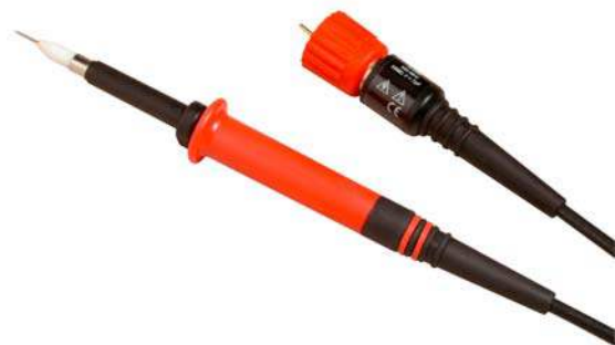
Model 6498 1000V CAT II Passive Oscilloscope Probe