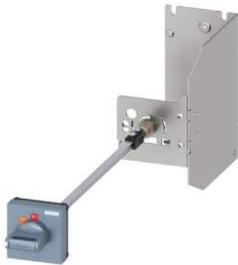
Door-coupling rotary operating mechanism for harsh conditions For circuit breaker Size S2 Handle gray