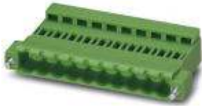
The illustration shows a 15-position version

Please be informed that the data shown in this PDF Document is generated from our Online Catalog. Please find the complete data in the user's documentation. Our General Terms of Use for Downloads are valid ( http://phoenixcontact.com/download )