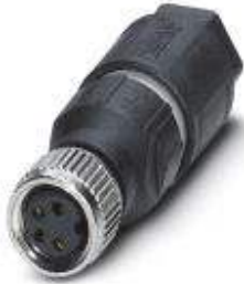
Sensor/actuator connector, female connector, straight, 4-pos., M8, QUICKON-ONE, metal knurl, maximum cable diameter of 5.0 mm

Please be informed that the data shown in this PDF Document is generated from our Online Catalog. Please find the complete data in the user's documentation. Our General Terms of Use for Downloads are valid ( http://download.phoenixcontact.com )