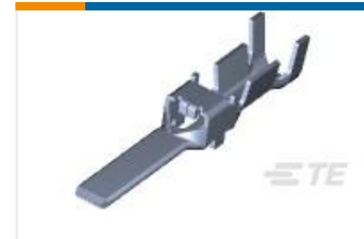
TE Part #1747419-2 DYNAMIC D4200 TAB CONT M