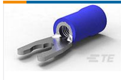
TE Part #52955 TERMINAL,PG SPR SPD 16-14 6