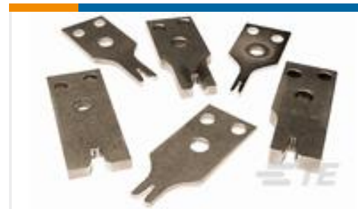
TE Part #1-409282-9 CRIMPER,INSULATION