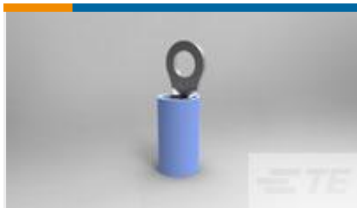
TE Part #8-320619-1 TERMINAL,PIDG R 16-14 6