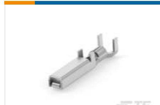
TE Part #1-175194-5 Contact: Component To Wire; 15A, 28-14 wire size