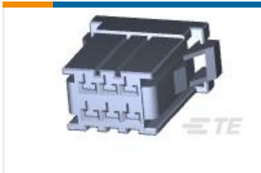
TE Part #178289-3 3.81 DYNAMIC REC HSG 6P D--D