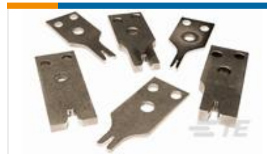
TE Part #234156-6 CRIMPER WIRE SPECIAL