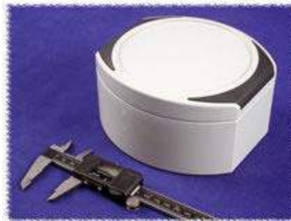
click to enlarge Relative View Caliper opened to 1" (25.4mm)

Path: Home > Enclosure Index > ROLEC-HAMMOND Aluminum Product Index > Round R280 aluDISC Series