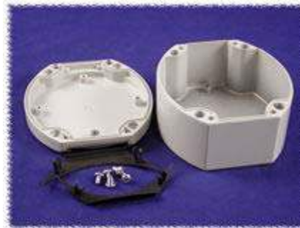
click to enlarge Internal View