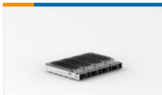
TE Part #2170745-2 CAGE ASSY, 1X4, QSFP28, SPRING, HS