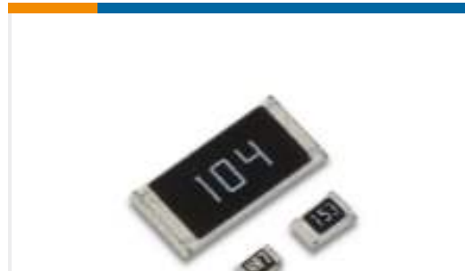
TE Part #1-2176337-9 CRGCO 0402 330R 1%