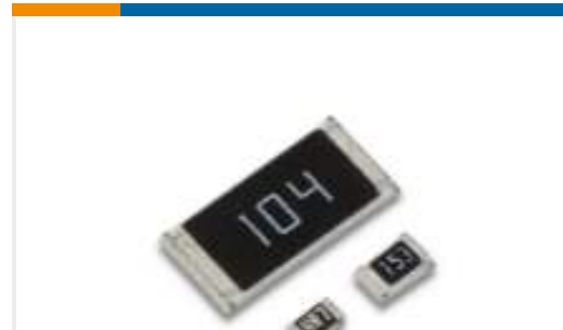
TE Part #3-2176339-7 CRGCO 0603 10K 1%