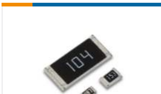
TE Part #4-2176339-4 CRGCO 0603 39K 1%