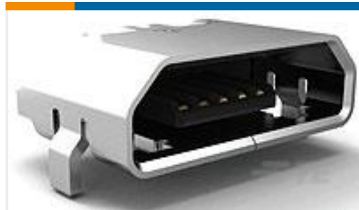
TE Part #2134536-2 MICRO USB, TYPE A/B, GRAY