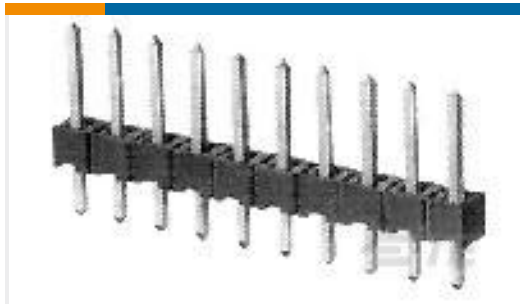
TE Part #826926-3 3P AMPMODU II PIN HDR.