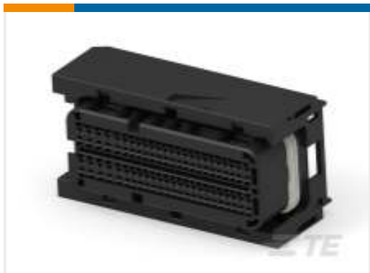
TE Part #2359941-1 96POS,MCON-1.2 CB,REC HSG,ASSY