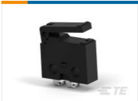
TE Part #2351461-3 MINSA SW HLV 0.30N 0.5A AC NO Sh-R-Bnd