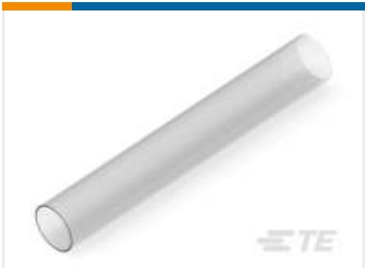
TE Part #3336796001 RBK-ESS-CROSS-10.0-X-8MM