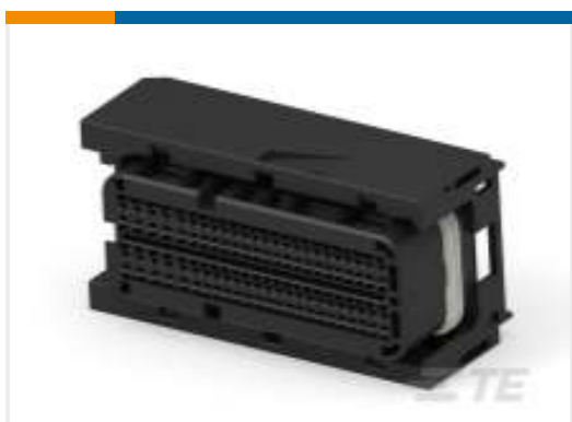
TE Part #2359941-6 96POS,MCON-1.2 CB,REC HSG,ASSY