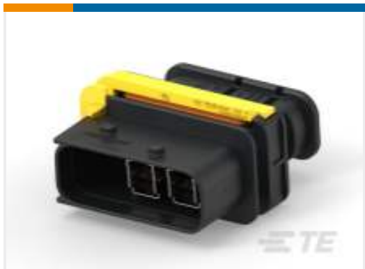
TE Part #9-2348782-1 HD MATEnet 2+6 TAB HSG ASSY, GRP E