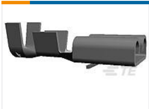
TE Part #5-160446-2 FF 250 REC 1.0-2.5MM2 TPPB