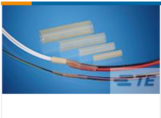
TE Part #CB88166002 RBK-VWS-125-NR1-X-100MM