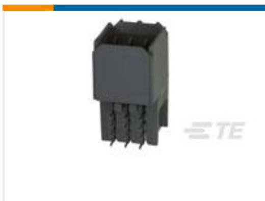
TE Part #5223961-1 TE UPM R/A Header 3P STD Power, LLL