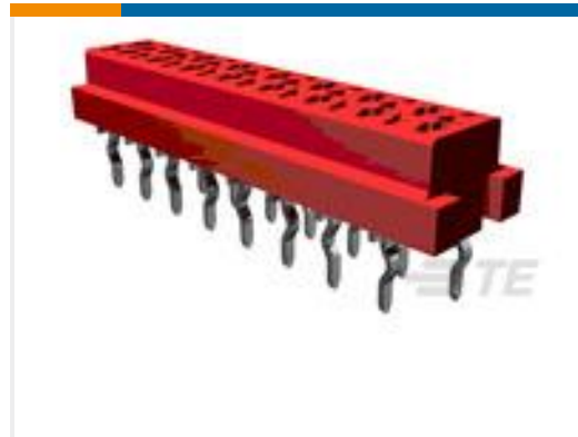
TE Part #7-215079-8 MICRO-MATCH FOB.08P