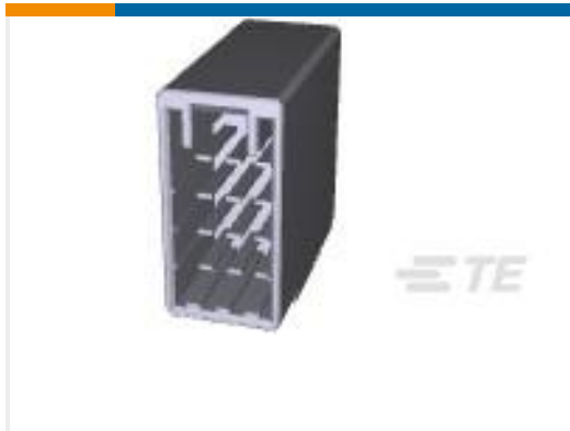
TE Part #178216-3 DYNAMIC 3400 HDR H 12P ASSY