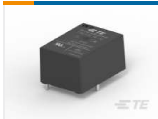
TE Part #1558661-3 T9GV1L14-12