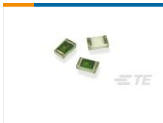
TE Part #6-1625867-7 RP 1J 0.166W 30R9 0.1% 25PPM 1K RL