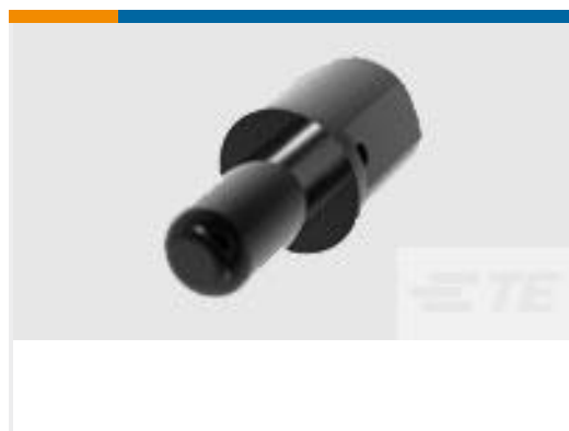
TE Part #1766274-1 CONTACT,PIN,#0