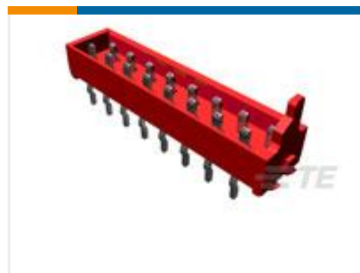
TE Part #1-215464-8 18P.MICRO-MATCH MOB