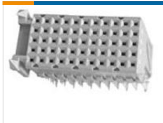
TE Part #5100161-1 Z-PACK/C RAF 55P