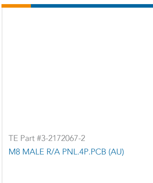
TE Part #3-2172067-2 M8 MALE R/A PNL.4P.PCB (AU)