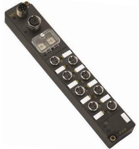
CANopen Certified Compact 30mm HarshIO Module

Module addressing: 1 – 99 by rotary switches or 1 – 125 by Set_Slave_Address command