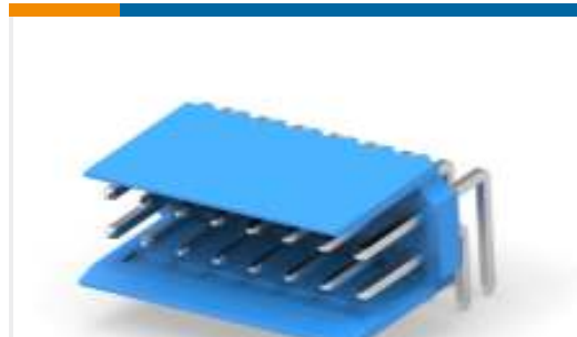
TE Part #281742-8 HE13/HE14 TH Headers, DRRR