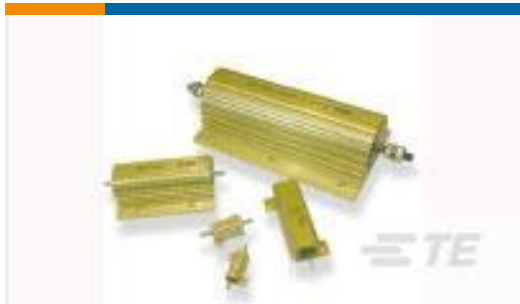
TE Part #1630027-1 HSC300 100R 5%