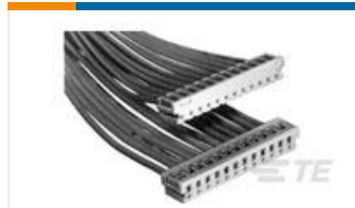
TE Part #1-179228-2 CT CRIMP-2 REC HSG 12P NATURAL