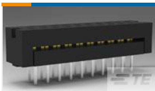
TE Part #1-746610-5 20 DIP PLUG, 100CL, LEAD FREE