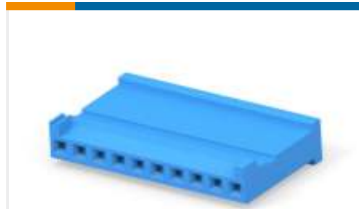
TE Part #281839-5 HE13/HE14 Crimp Housings