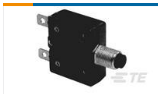
TE Part #1-1423674-0 W54-XB1A4A10-25=CKTBKR,THERM,P