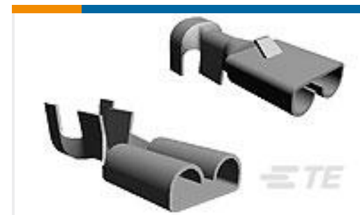
TE Part #280919-2 FF 187 REC 0.5-1.5MM2 TPBR