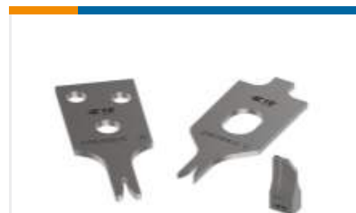
TE Part #7-2385499-7 Applicator KIT