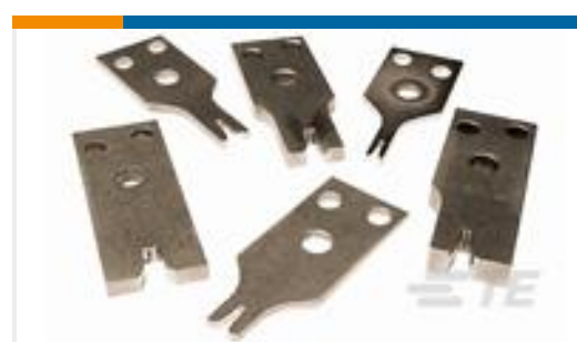
TE Part #4-654223-7 DRAHTCRIMPER