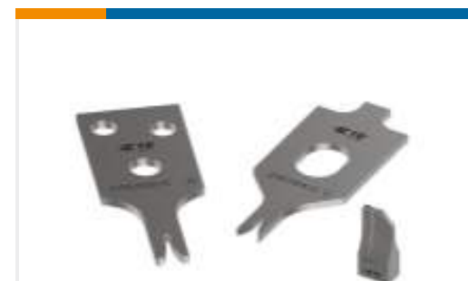
TE Part #7-2385500-7 Applicator KIT