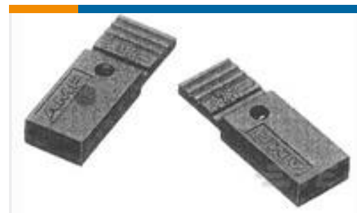
TE Part #880584-4 SHUNT CONNECTOR