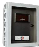
NEMA 4X Model