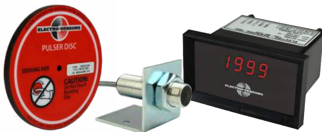
Standard System with: AP1000, 906 Speed Sensor, 255 Pulser Disc

A standard system includes the AP1000 tachometer, a shaft-end mounted pulser disc or split collar pulser wrap, and a Hall Effect Sensor. The pulser generates an alternating magnetic field that is picked up by the large gap, non-contact sensor, which transmits this signal as a digital pulse to the AP1000 via a 3-conductor shielded cable. The AP1000 translates this signal into Hertz or other desired programmable user units such as RPM, FPM, GPM, or TIP (Time-in-Process) and displays them on the front panel LEDs.