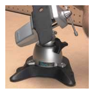
Click on any of the above images to find out more about the products pictured.

Webiste and content, copyright PanaVise Products, Inc. 1996 - 2011. PanaVise, PanaPress, PV Jr, Posi-Stop, Slimline, Slimline 2000, Uniflex, Stay-Put, PortaGrip 2000, InDash, WindowGrip, Deluxe Multi Media Mount, Clip Caddy, and Vise Buddy are registered trademarks or trademarks of PanaVise Products, Inc. in the U.S. and in other countries. PanaVise's products are protected under one or more of the following U.S. Patents: 2,898,068; 3,661,376; 5,118,058; 5,187,744; 5,465,932; D390,849: D582,994. Patents pending on additional products in the U.S. and in other countries. PanaVise has a long history of vigorously prosecuting violations and/or protecting both its physical and intellectual property rights. All PanaVise Products are covered by a Limited Lifetime Warranty