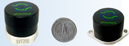
True real-time wireless vibration sensor SVT200-V

Ultra-low power wireless vibration & temperature sensors SVT200-V, SVT30-V and SVT400-V provide true real-time machine condition monitoring continuously 24/7 non-stop. The sensor samples x, y and z axes acceleration continuously, and switches to 6.4kHz sampling rate immediately if the acceleration exceeds 0.1g in any of the axes. The sensor acquires a fixed number of samples, calculates velocity RMS and acceleration RMS value, and sends the result plus temperature to the wireless gateway.