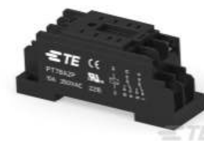
TE Part # 2071566-4 PT78A2P