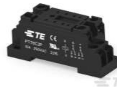
TE Part # 2071566-3 PT78C2P