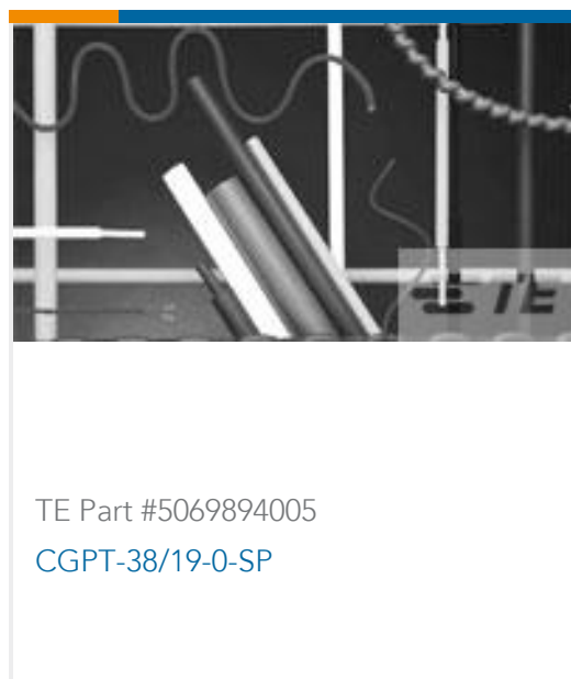
TE Part #5069894005 CGPT-38/19-0-SP