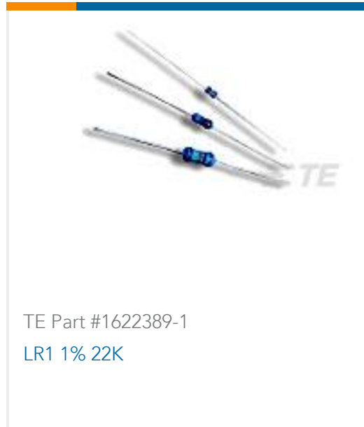
TE Part #1622389-1 LR1 1% 22K