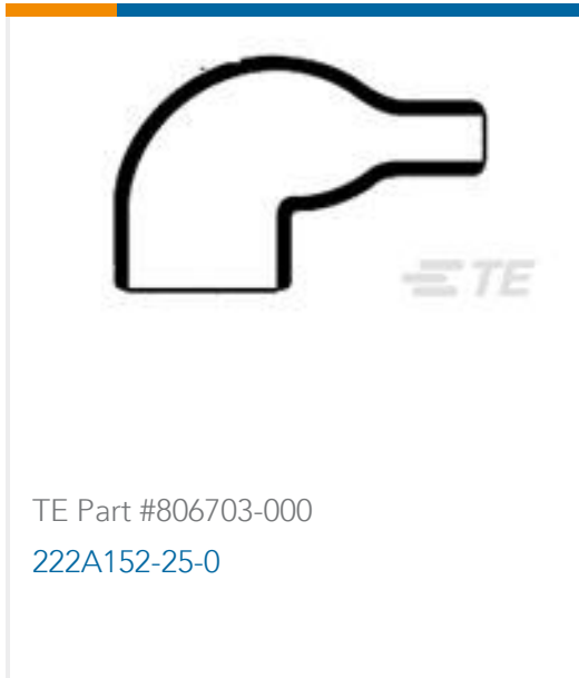
TE Part #806703-000 222A152-25-0