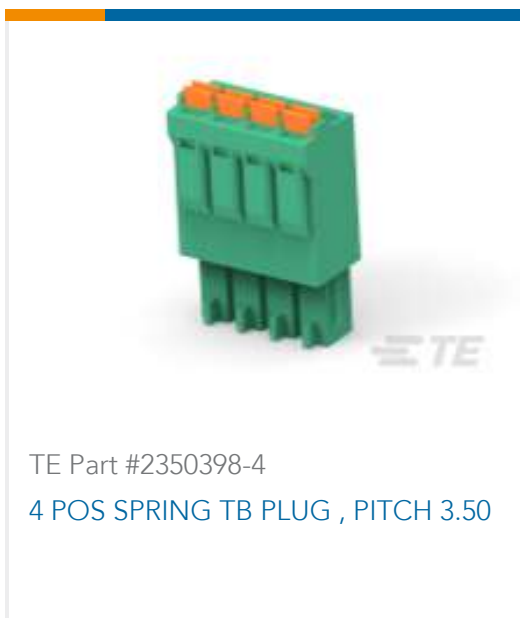
TE Part #2350398-4 4 POS SPRING TB PLUG, PITCH 3.50