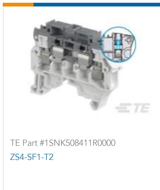
TE Part #1SNK508411R0000 ZS4-SF1-T2