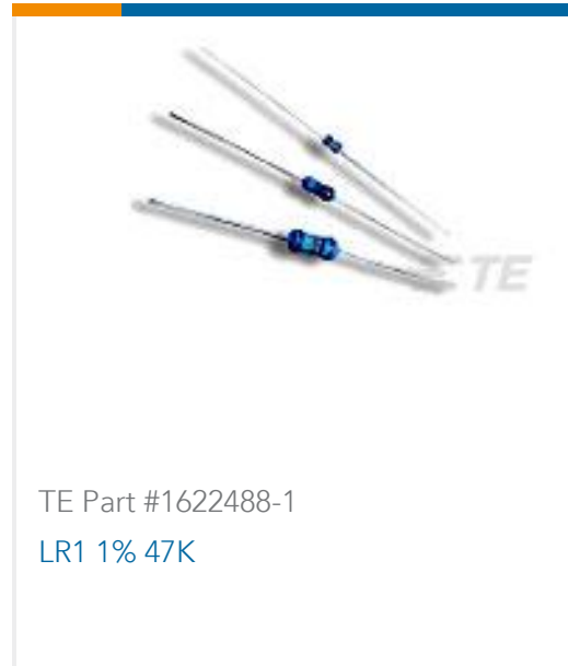
TE Part #1622488-1 LR1 1% 47K