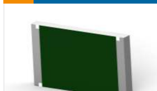
TE Part #8-2176407-8 3560 27R 5%