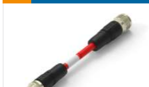
TE Part #TAA545B1411-060 M12A4-MS-FS-PVC-6.0M