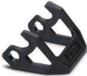
Replacement double locking latch for HEAVYCON EVO housing, HC-B10/HC-B16/HC-B24, PA

Please be informed that the data shown in this PDF Document is generated from our Online Catalog. Please find the complete data in the user's documentation. Our General Terms of Use for Downloads are valid ( http://phoenixcontact.com/download )