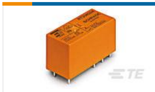
TE Part #1-1649329-3 RT424012