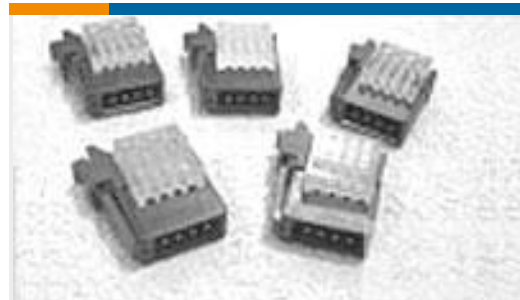
TE Part #1473562-3 RITS CONN. PLUG ASSY 3P YELLOW