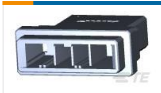
TE Part #2-179552-4 DYNAMIC D-3200S TAB HSG 4P K/Y