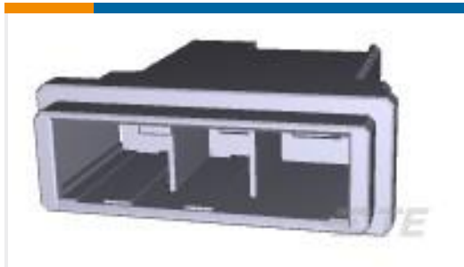
TE Part #1-353046-3 DYNAMIC D-5200S TAB HSG 3P K/X