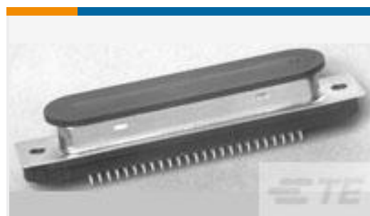
TE Part #553444-5 PLUG ASSY, ACTION PIN, CHAMP-LOK